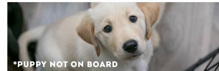
*PUPPY NOT ON BOARD