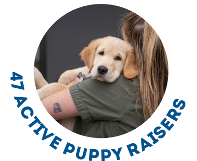
47 ACTIVE PUPPY RAISERS