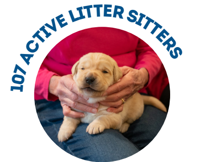
107 ACTIVE LITTER SITTERS