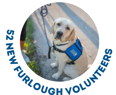
52 NEW FURLOUGH VOLUNTEERS